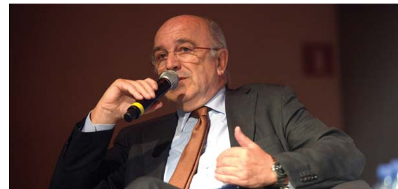
Photo on top: "The European Union is the most remarkable achievement of the past century, creating an unprecedented period of peace, democracy, co-operation and prosperity in Europe." European Commissioner for Competition, Joaquín Almunia at the Relaunching Europe event in Brussels, October 2012.

We believe that the solution is not less Europe, but a closer, better Europe. We need your help to develop this idea and we want to learn from all of you, from your life experience and your expectations for a better life. We need you to relaunch Europe.