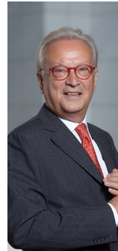
Hannes Swoboda, S&D Group President