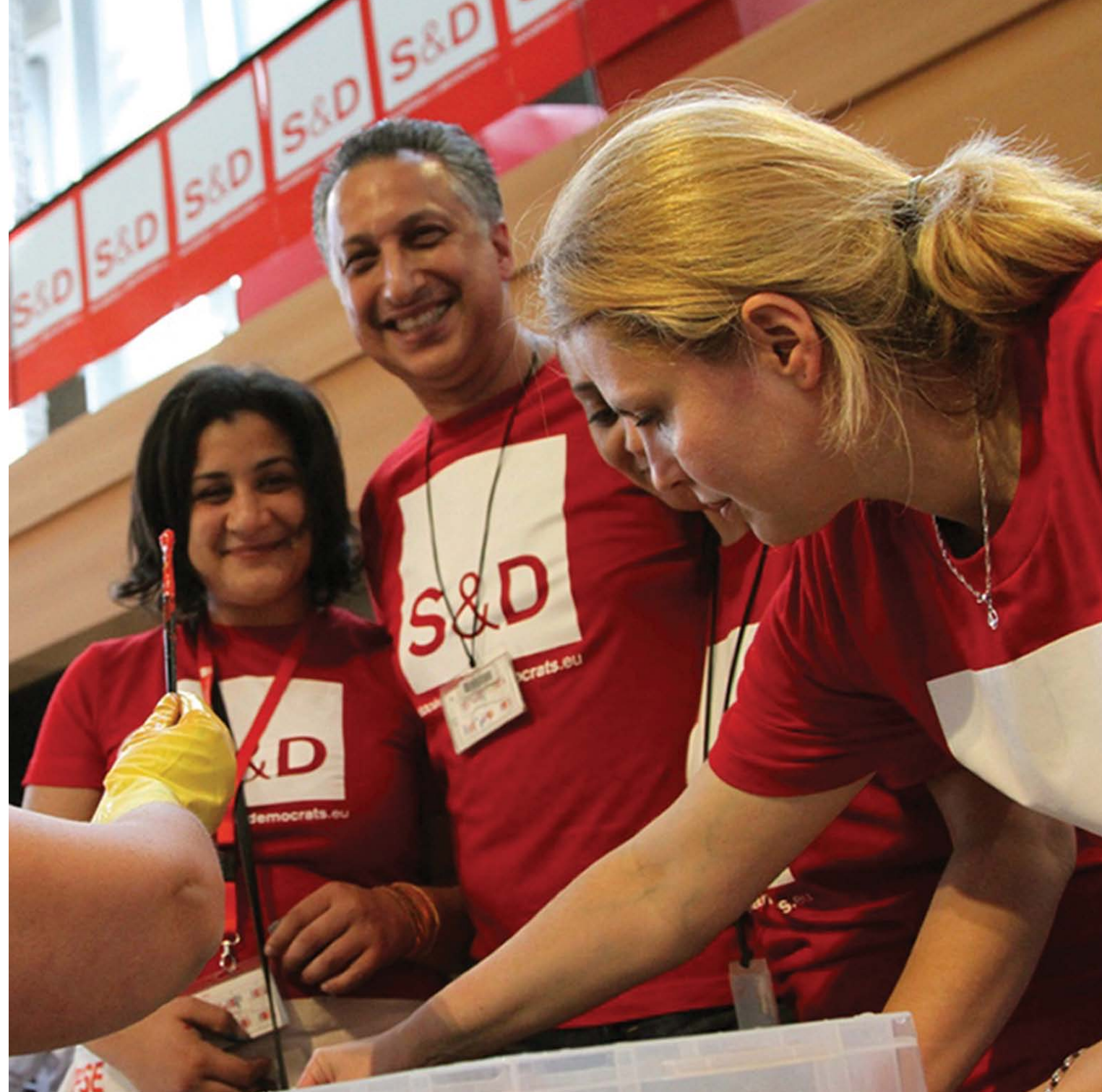
Photo on right: S&D Group staff at the Open Days in the European Parliament – Strasbourg, 20 May 2012