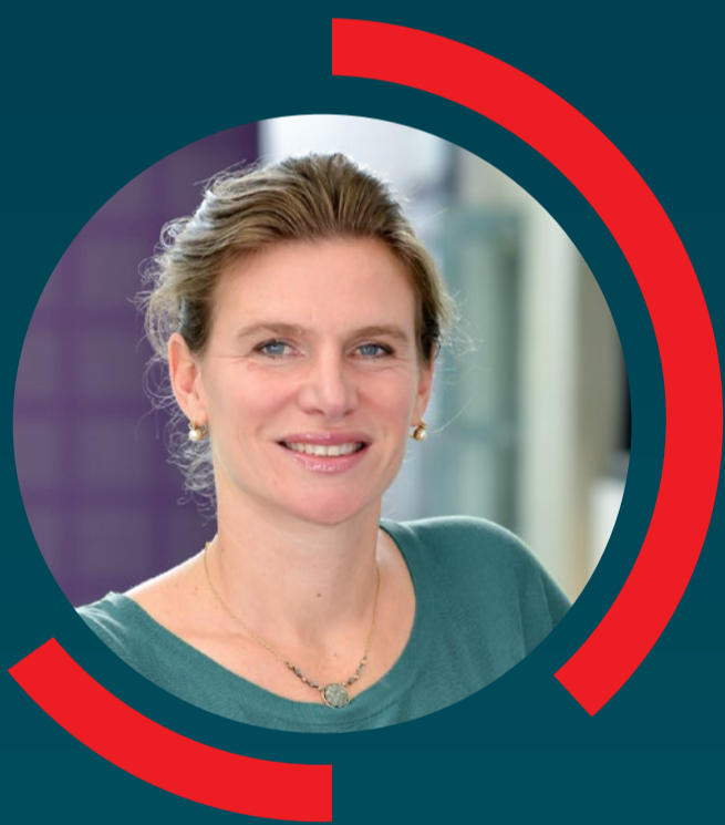
PROFESSOR MARIANA MAZZUCATO RM Phillips chair in the Economics of Innovation, SPRU, University of Sussex