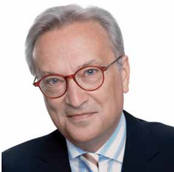
Hannes Swoboda S&D Group President

A handwritten signature in black ink, appearing to read 'Hannes Swoboda'.