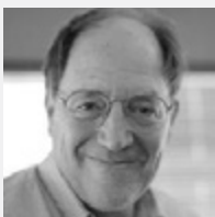
James K. GALBRAITH

Professor of Sociology University Pompeu Fabra, Barcelona, Spain