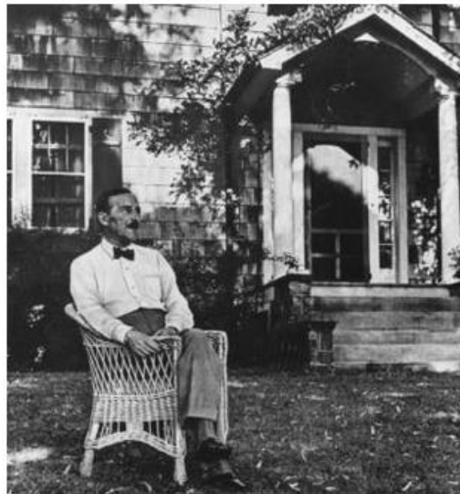
Stefan Zweig in Ossining, New York, in 1941, seven years after he fled the ascendant Nazism of Europe.

The Austrian émigré writer Stefan Zweig composed the first draft of his memoir, “The World of Yesterday,” in a feverish rapture during the summer of 1941, as headlines gave every indication that civilization was being swallowed in darkness. Zweig’s beloved France had fallen to the Nazis the previous year. The Blitz had reached a peak in May, with almost fifteen hundred Londoners dying in a single night. Operation Barbarossa, the colossal invasion of the Soviet Union by the Axis powers, in which nearly a million people would die, had