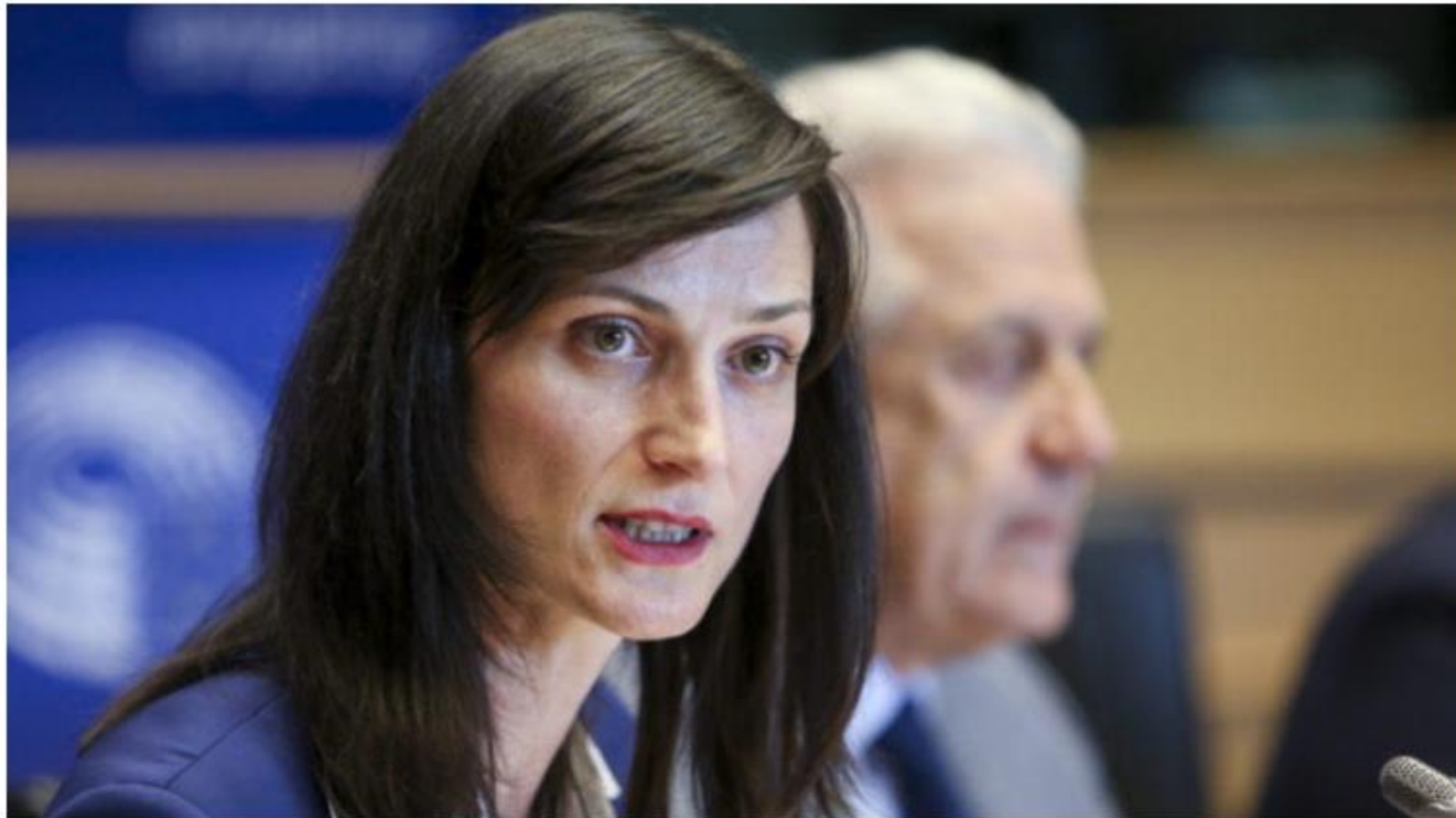
New EU Commissioner Mariya Gabriel will start work on an EU response to fake news this autumn.