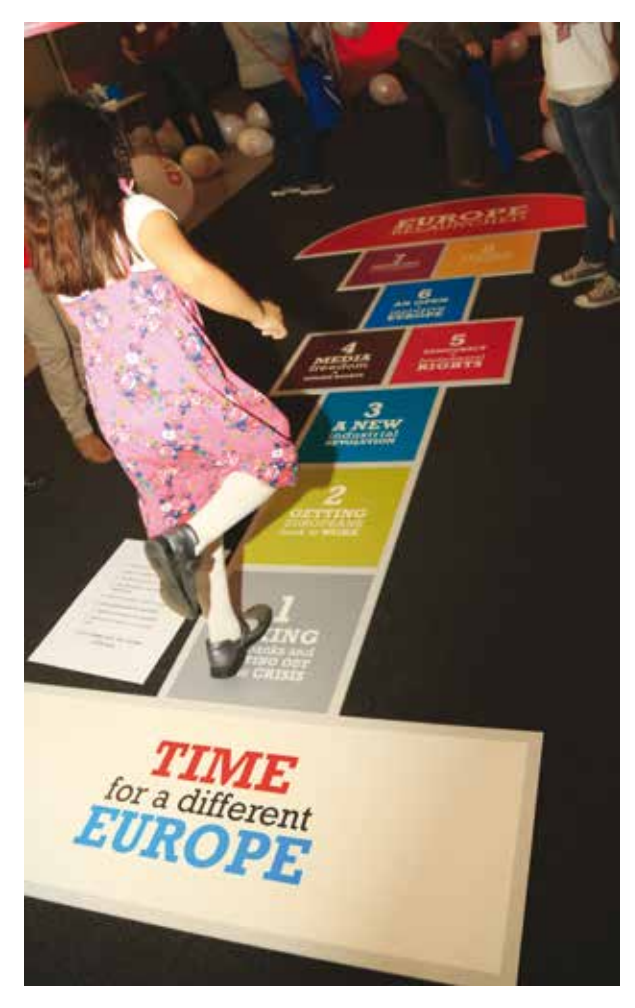
S&D engaging with visitors during the Open Days event.