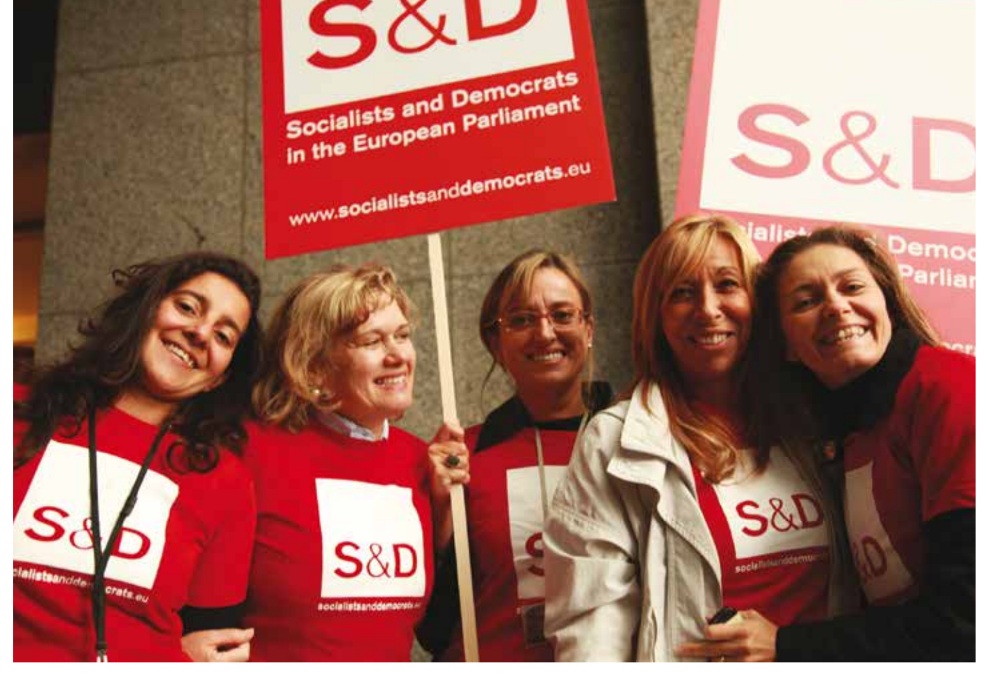
S&D Group Secretariat staff engaging in a wide array of activities for promoting S&D Group values to the wider audiences.

The Secretariat supports environmental working standards on a day-to-day basis and offers modern working arrangements (part-time, flexitime and telework) to all staff members.