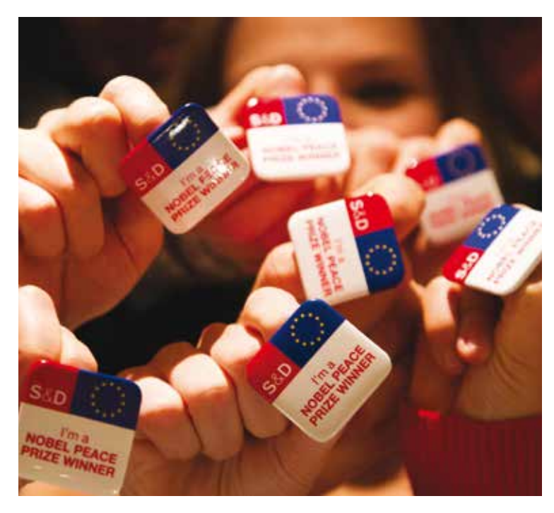
"The work of the EU represents fraternity between nations"- Alfred Nobel.